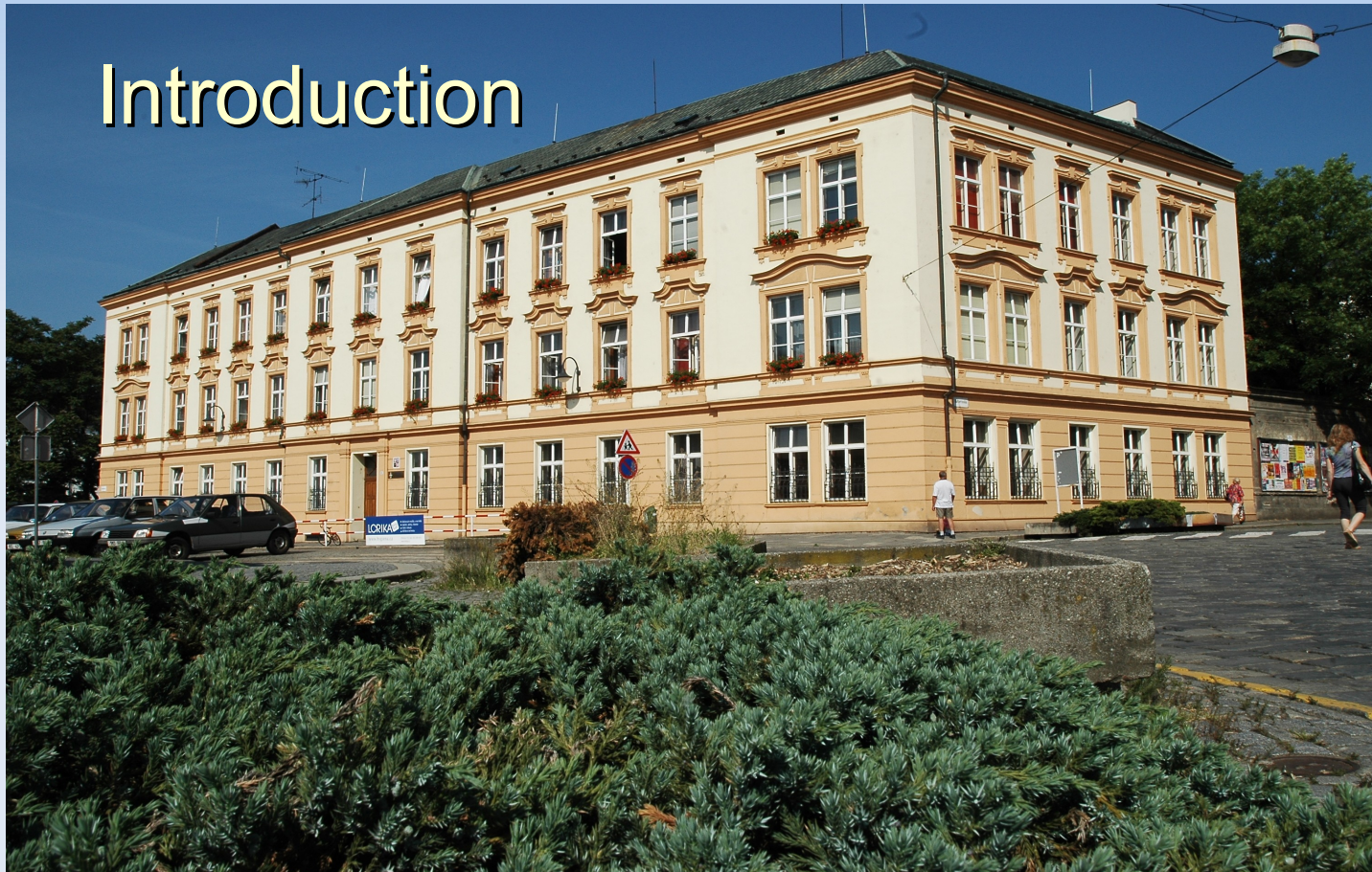
Základní škola sv. Voršily v Olomouci | The basic school of st. Ursuline