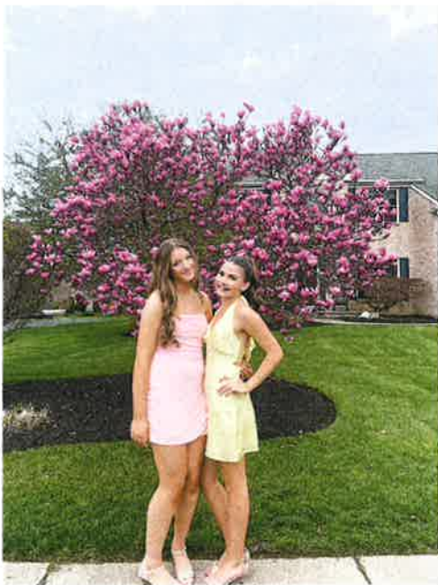
That's me in the pink

I was so happy to receive your letter. I haven't talked to you in a hot minute so let's recap on what happened. First I had a dance with boys and girls from different schools. It was so much fun and I gotta dress up and look all cute. I have spring break in a week and i'm doing a lot of stuff. First I'm going to my brother's college spring game then I'm going to Florida with 3 of my friends from school and their families. After that I'm going on a big road trip back up to Delaware so my sister can look at colleges because she is in 10th grade and starting to look already. After spring break I'm going to Williamsburg, VA with my class for a school trip. We stayed there for 3 days and 2 nights. We are going to Busch Gardens (it's an amusement park), bowling, a ghost tour and so much more. We only have 36 days left of school until summer!!!!!! I'm about to have my last club volleyball tournament in a couple days and I'm so sad because I loved this season so much. I'm excited for my next letter from you.