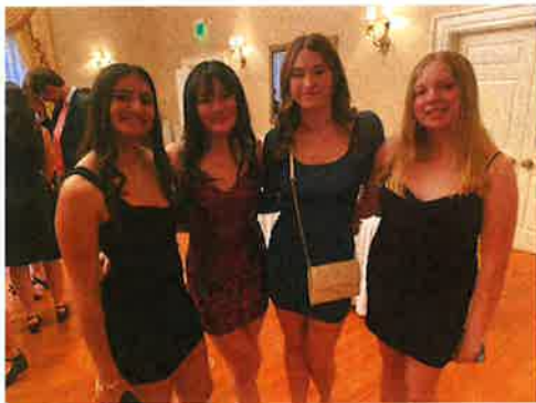
Me and my friends (below)